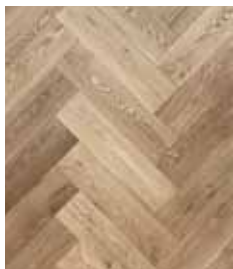
brushed natural oak