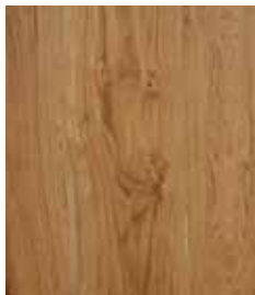
brushed natural oak